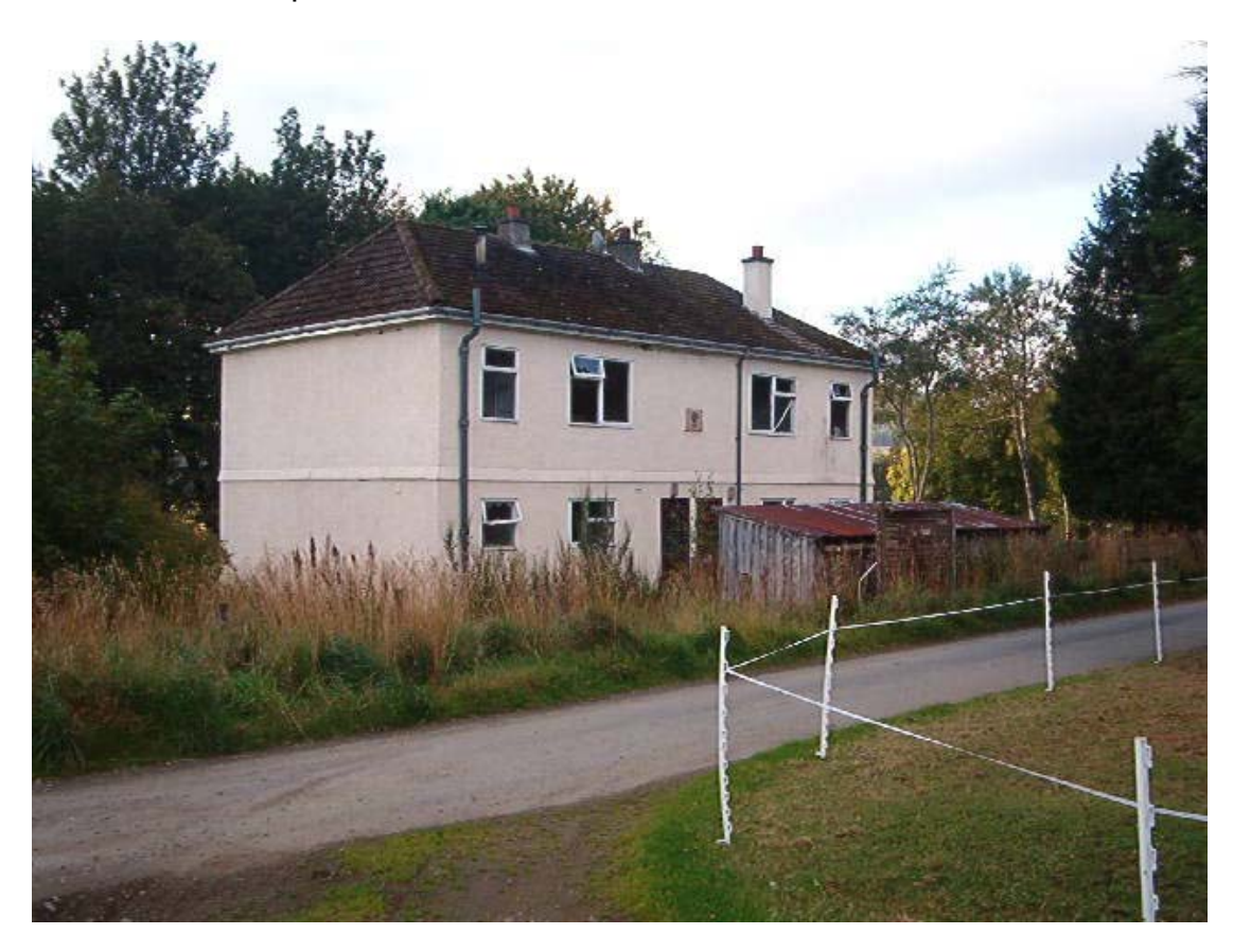
Fig. 2 Application site immediately to left of existing semi detached houses to be redeveloped as 2 detached.

1. This outline application is for the erection of a house on an area of vacant ground, close to other buildings. To the west there is a pair of empty semi-detached houses, and to the north are former agricultural steadings, now converted to two dwellings. To the north-east is another small detached house and to the east is the driveway to a larger one and a half storey house positioned to the south east of the application site. The application site lies within a grouping of existing houses. There are trees in the vicinity of the site, but no trees are affected by the development.